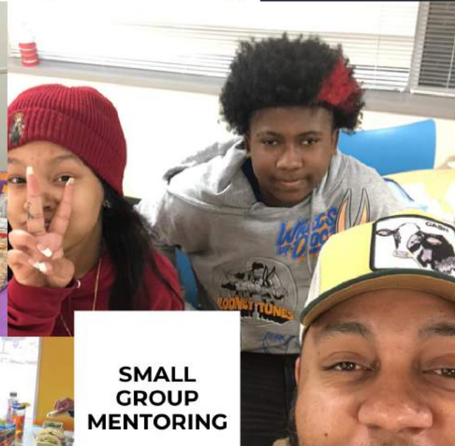
SMALL GROUP MENTORING