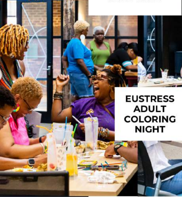
EUSTRESS ADULT COLORING NIGHT