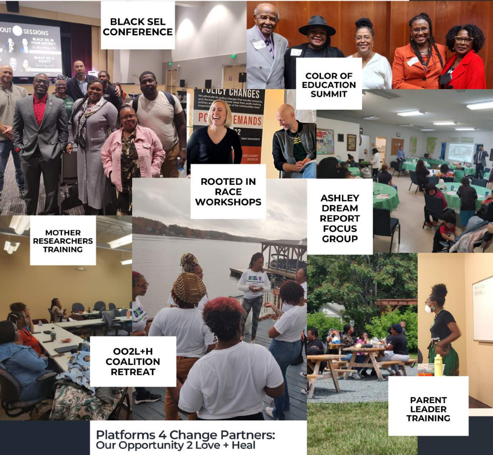
BLACK SEL CONFERENCE