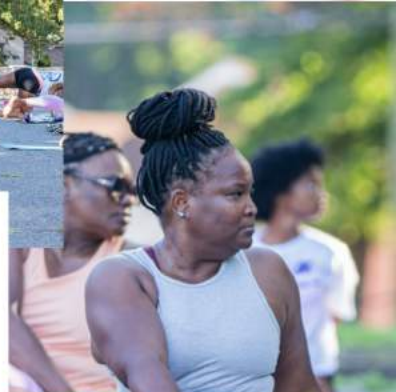
SATURDAY MORNING YOGA