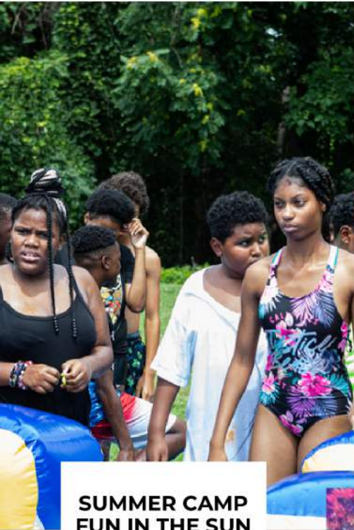
SUMMER CAMP FUN IN THE SUN

Scholars and Advocates Relationship Building